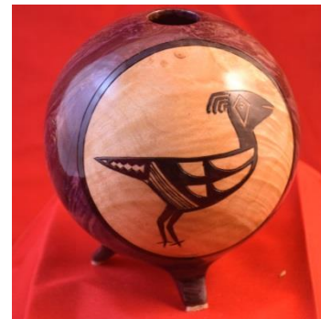
Ralph Watts – Maple Hollow Vessel