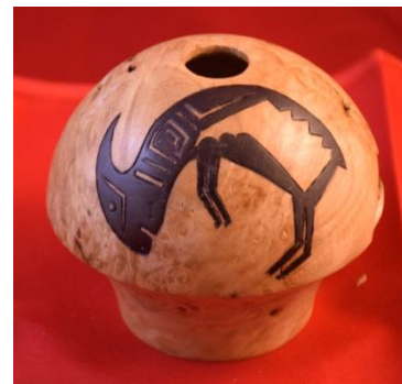
Ralph Watts – Maple Hollow Vessel