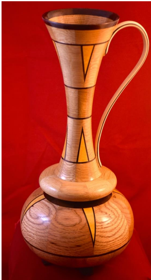
Irling Smith - White Oak, Red Oak, Peruvian Walnut, Satinwood and Holly Segmented Vase