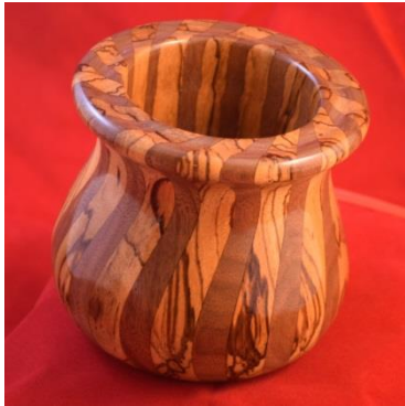
Scott Eckstein - Wedge segmented Zebrawood/ Walnut Vase