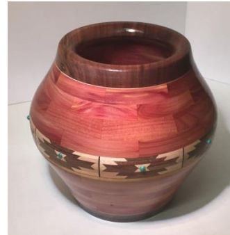
Don Best – Segmented Vessel