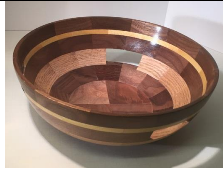
Ron Bahm – Walnut/Oak/Yellowwood Bowl

The photographer will only be available until 8:45 A.M. on the day of the meeting to take photos of the instant gallery items.