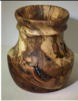
Jim Breeden – Spalted White Oak Vessel