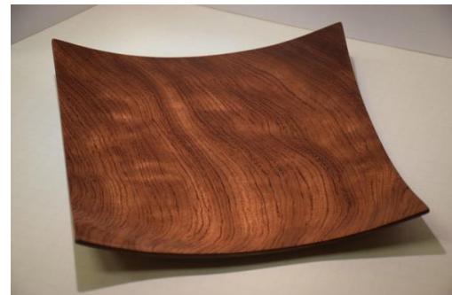
Bob Stauch – Bubinga Platter