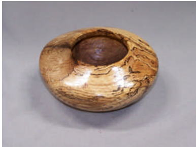
Ed Otero - Spalted oak