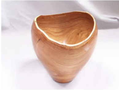
Ed Otero - Chinese elm