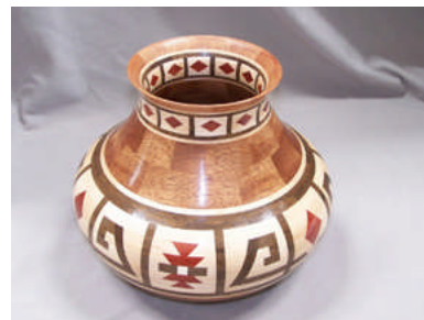
Irling Smith - Maple, Peruvian walnut, bloodwood, holly