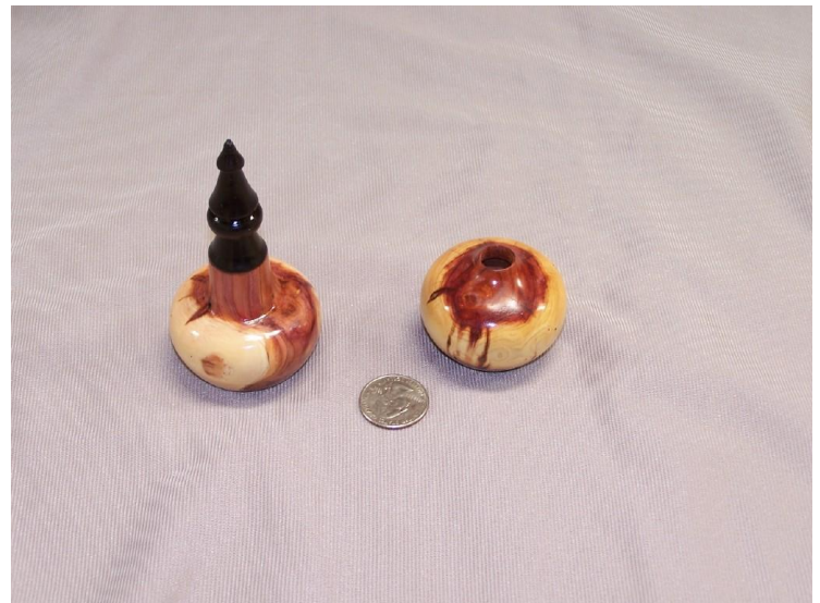
Bill Mantelli - Unknown Wood