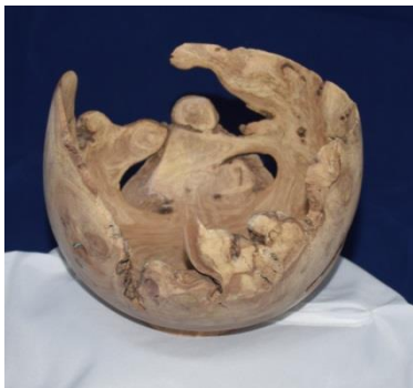
Jim Breeden – Holly Root Natural Edge Bowl