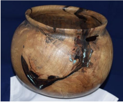
Jim Breeden – Catalpa Burl Bowl

The photographer will only be available until 8:45 A.M. on the day of the meeting to take photos of the instant gallery items.