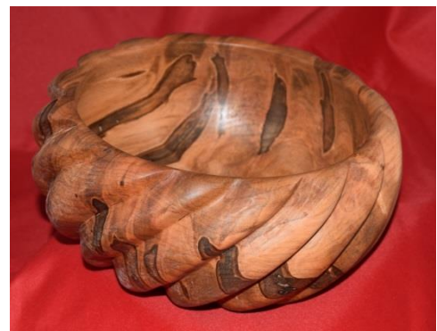
Vic Myers – Carving Enhanced Maple Bowl