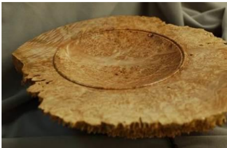
Nate Davey - Maple Burl Platter