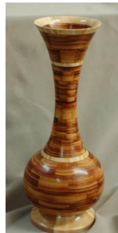
Irling Smith - Arcadia, Curly Maple Segmented HF