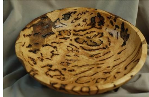
Taz Bramlette - Oak Burl Platter