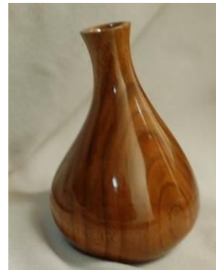
Bill Mantelli - Walnut Vase