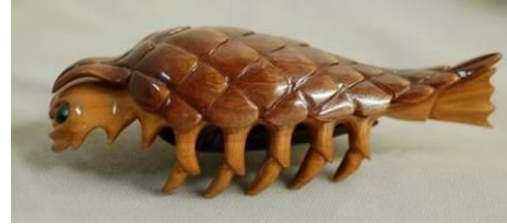
Ralph Watts - Cherry Boxwood Box