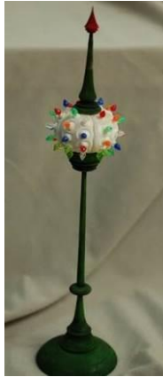
Don Thompson - Sea Urchin, Birch Ornament