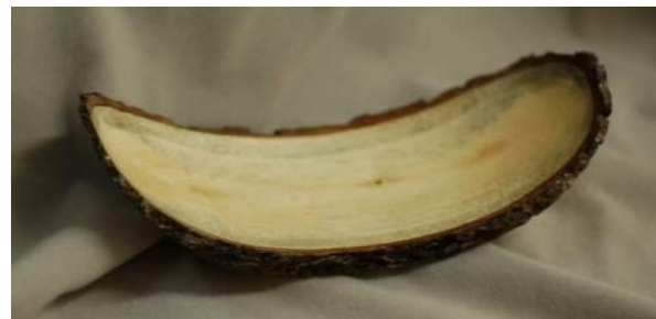
Bill Mantelli - Natural Edge Pinon Bowl