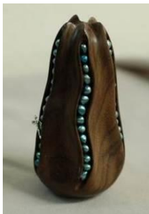
Ralph Watts - Indian Rosewood Box