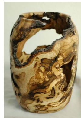
Taz Bramlette - Oak Burl HF