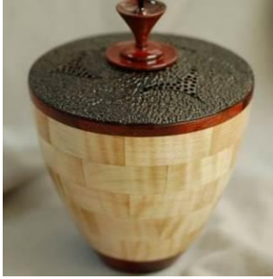
Jim Preston - Wenge, Curly Maple, Bloodwood, Ebony Vase