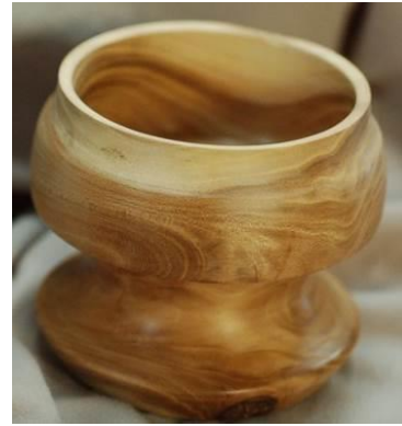
Pat Beatty- Elm Coin Bowl