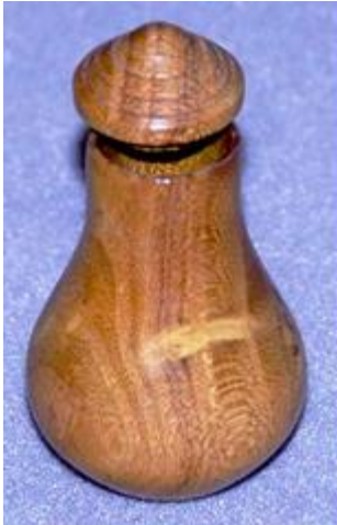
Bill Kalb - Pecan Mini-pot with lid