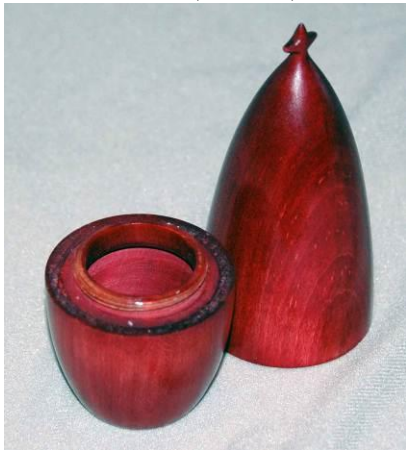
Ralph Watts – Lidded box