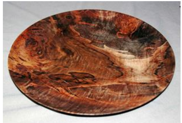
Nate Dave - Maple Platter