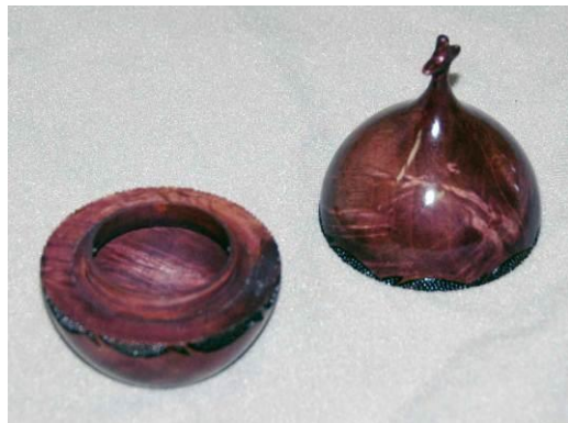
Ralph Watts – Lidded box