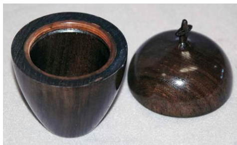
Ralph Watts – Lidded box