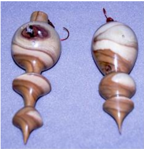
Bill Kalb - Aspen Ornaments