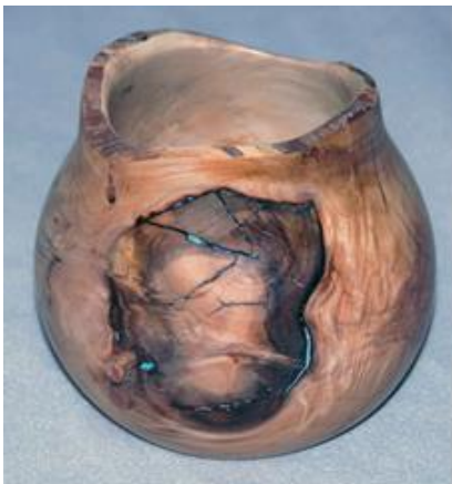
Jim Breeden - Pot