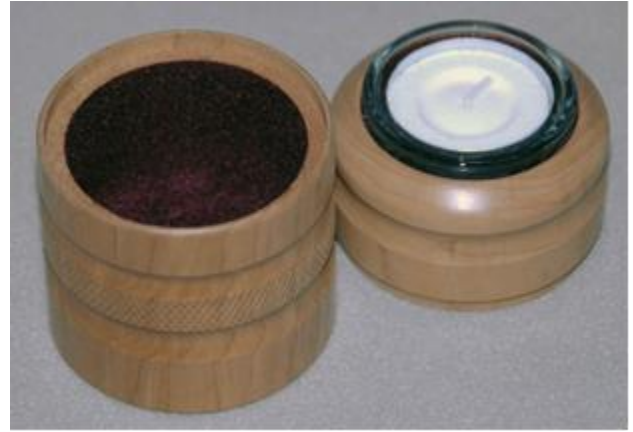
Jim Breeden - Candle Box