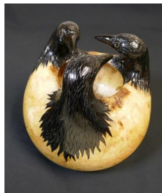
Ralph Watts – Crows Carved Bowl