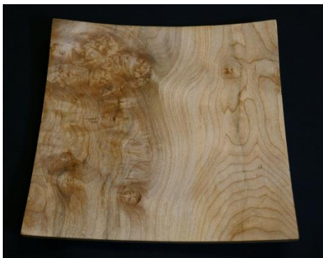
Hy Tran - Big Leaf Maple Squared Platter