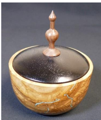
Larry Linford – Red Gum / Mahogany Lidded Box