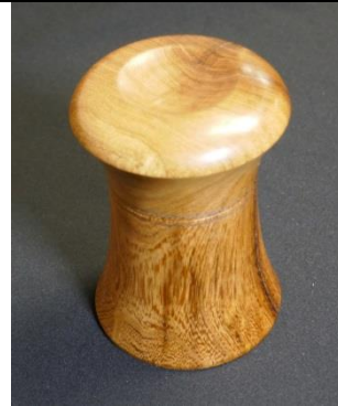
Hy Tran – Mesquite Box

The photographer will only be available until 8:45 A.M. on the day of the meeting to take photos of the instant gallery items.