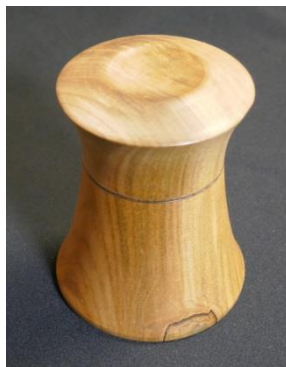
Hy Tran - Maple Lidded Box