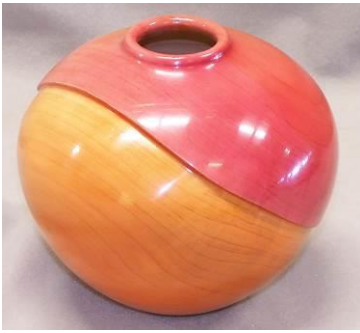
Bob Stauch - Cottonwood dyed closed form