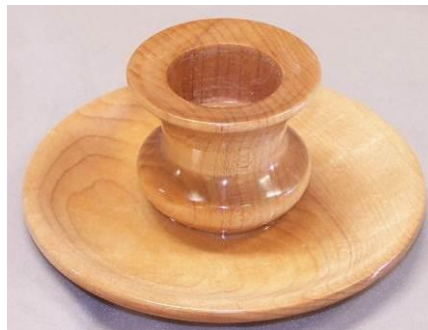
Bill Kalb – Maple Candlestick