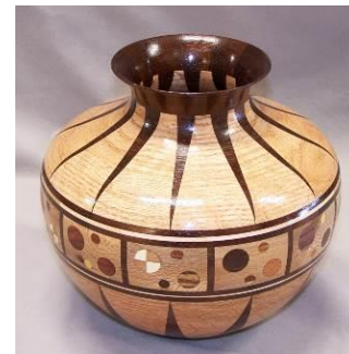
Irling Smith - Segmented Bowl with Oak, Peruvian Walnut, Maple, Sycamore