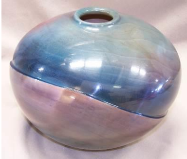
Bob Stauch - Arizona Cypress dyed closed form