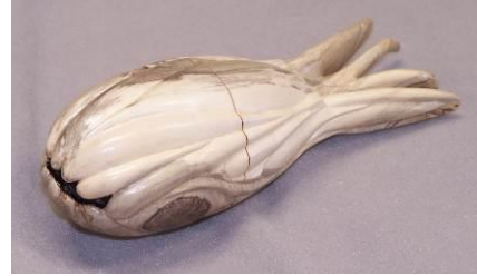
Ralph Watts - Holly Lidded Box