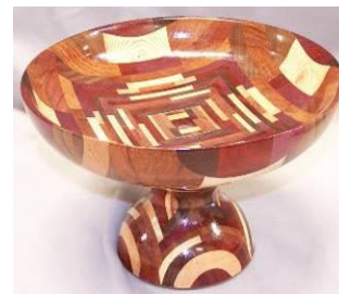
Don Datet - Bowl with various wood