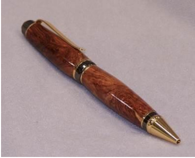
Hy Tran - Rosewood Pen