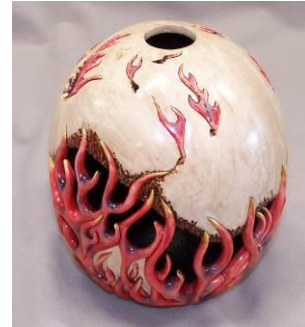
Ralph Watts - Big Leaf Maple Burl hollow form on fire