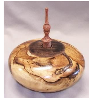
Nate Davey - Spalted Acacea hollow vessel