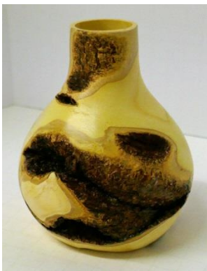
Scott Eckstein – Bird of Paradise Burl Bud Vase