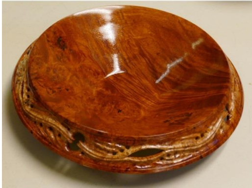
Ralph Watts – Mesquite Bowl

The photographer will only be available until 8:45 A.M. on the day of the meeting to take photos of the instant gallery items.