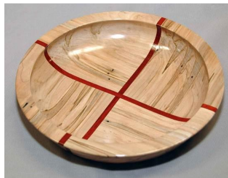
Scott Eckstein – Maple and Bloodwood Dish