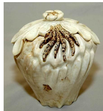
Ralph Watts – Broad Leaf Maple Burl Vessel