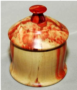
Jim Breeden – Box Elder