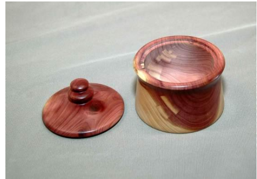
Jim Breeden – Red Cedar Box