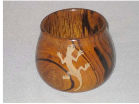
Ken Pilkington 1 - Ironwood pot