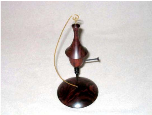
Gale Greenwood - Birdhouse (wood unknown)