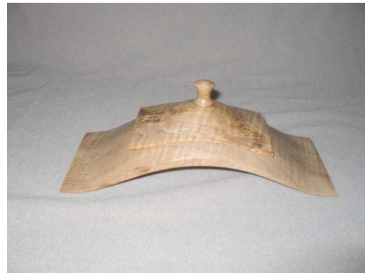
Ray Berry 1 & 2 - Rectangle bowl (wood unknown)