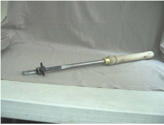
Colin Crawford 2 - Chatter tool