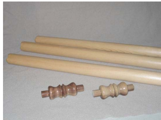
Jack Schamaun - Wicket (pine & walnut)