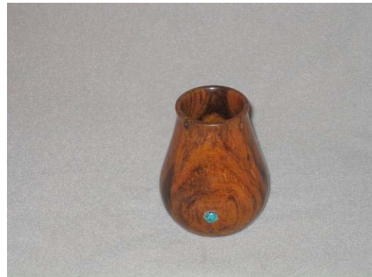
Ken Pilkington 2 - Ironwood pot