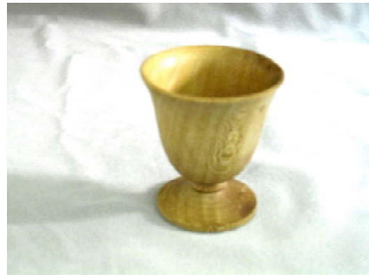
Colin Crawford 1 - Sycamore goblet