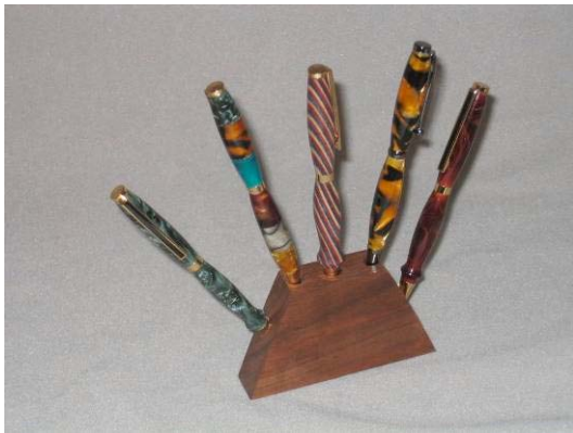
Ron Bahm - Pens (Diamondwood & Acrylic)