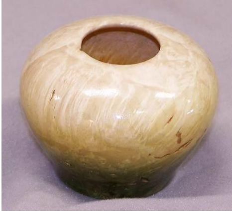
Ralph Watts – Elm Vase