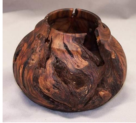
Jim Breeden - Mesquite Root HF