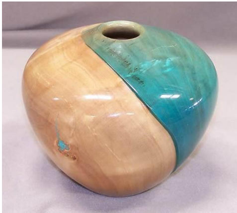
Bob Stauch – Cottonwood Dyed HF