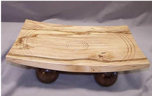
Ralph Watts – Elm / Ash Stool