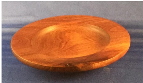
Hy Tran – Walnut Plate