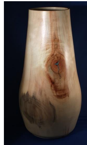
Taz Bramlette – Aspen Vase