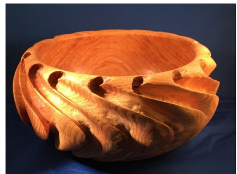
Vic Myers – Carved Locust Bowl