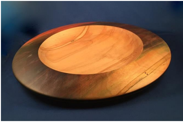
Jim Breeden - Dyed Edge Ambrosia Maple Platter