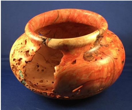
Jim Breeden – Box Elder Hollow Vessel