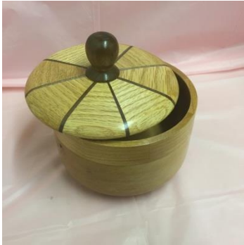
Ron Bahm – Bigleaf Maple, Cherry, Oak, Walnut