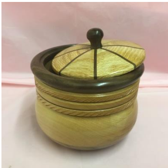
Scott Eckstein – Bigleaf Maple and Walnut