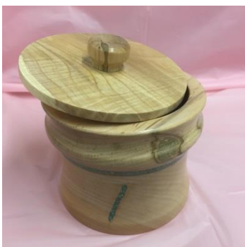
Tom McClarty – Bigleaf Maple with Turquoise