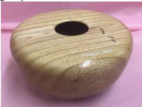
Larry Linford – Chinese Elm HollowForm

The photographer will only be available until 8:45 A.M. on the day of the meeting to take photos of the instant gallery items.