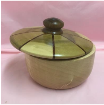
Drake Ward – Bigleaf Maple