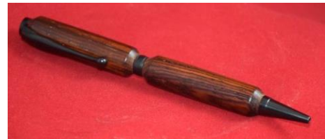
Carl Gonzales – Desert Ironwood Pen