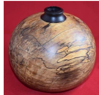
Vic Meyers – Maple Hollowform