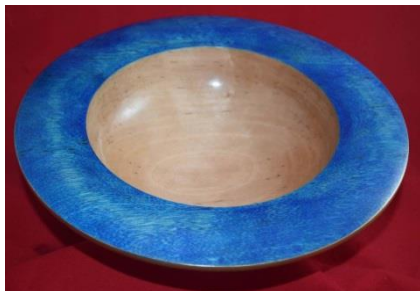
Hy Tran – Birch Platter