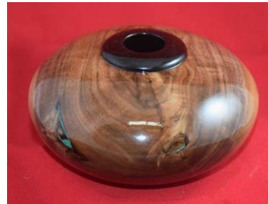
Jim Preston – Black Walnut / Blackwood Bowl