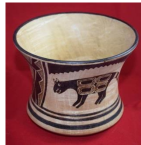
Ralph Watts – Catalpa Vase