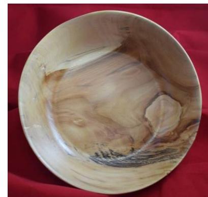
Pat Beatty – Cottonwood Bowl

The photographer will only be available until 8:45 A.M. on the day of the meeting to take photos of the instant gallery items.