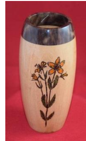
Jim Preston – Maple / Walnut Vase