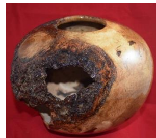
Taz Bramlette – White Oak Burl Hollowform