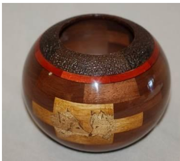
Jim Preston - Peruvian Walnut, Wenge, Bloodwood Bowl