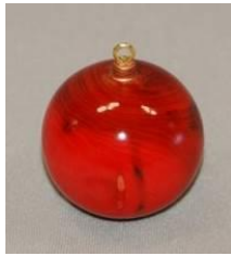
Bill Kalb - Aspen Ornament