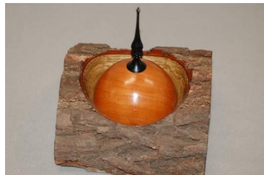
Nate Davey – Pecan Natural Edge box