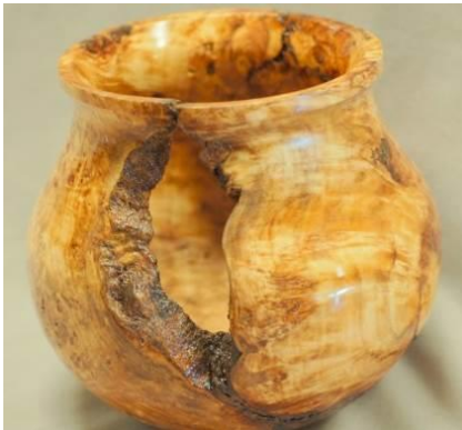
Taz Bramlette – Cottonwood Burl Hollow form