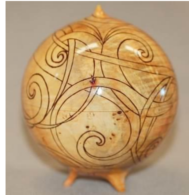
Ralph Watts – Box Elder Box