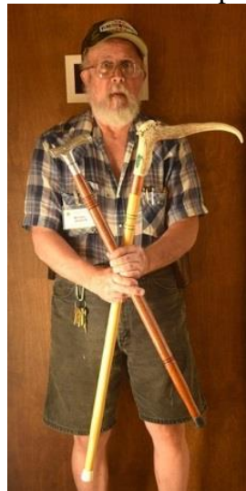
Michael Jackson – Walking Stick / Cane