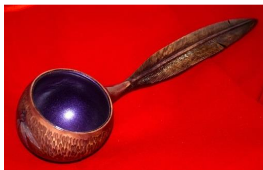
Ralph Watts – Pear Feather Dipper