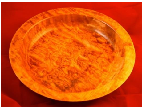
Bill Kalb – Big Leaf Quilted Maple Burl Shallow Bowl

The photographer will only be available until 8:45 A.M. on the day of the meeting to take photos of the instant gallery items.