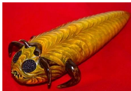
Ralph Watts – Pear Box