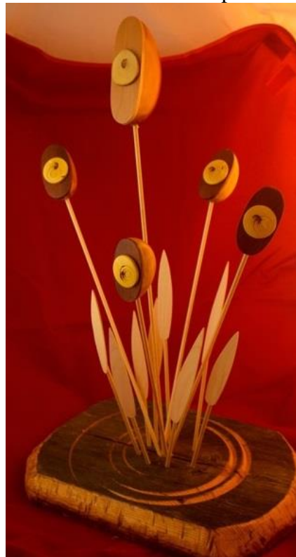
Rob Bahm – Multiple woods in an art piece