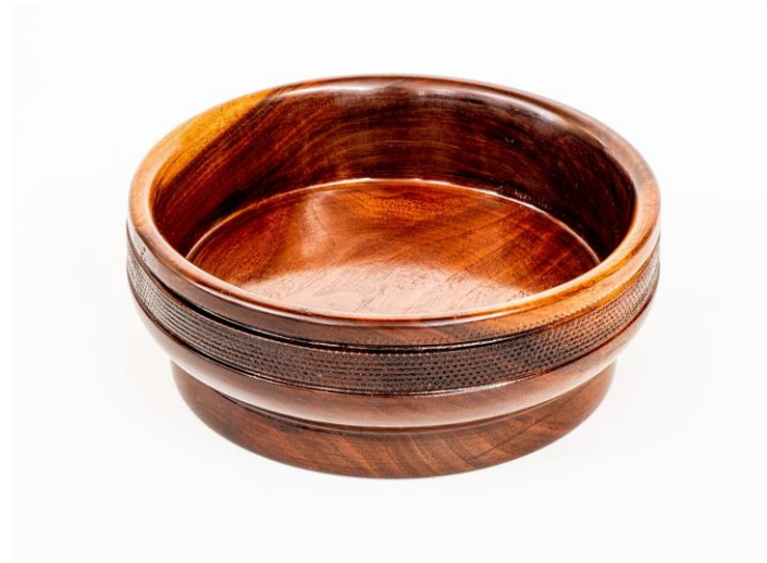
David Waldrep with a Black Walnut bowl