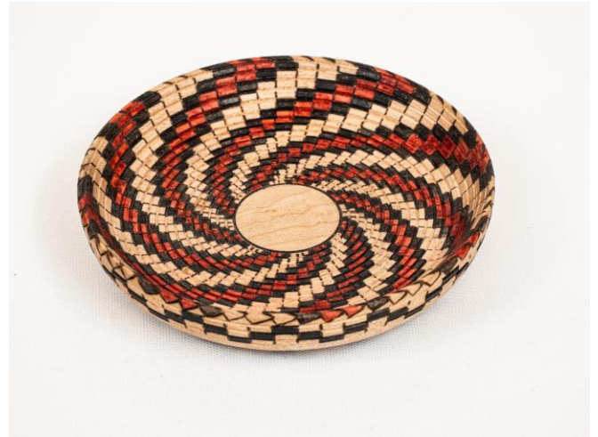
Jim Scott with a Maple basket illusion shallow bowl