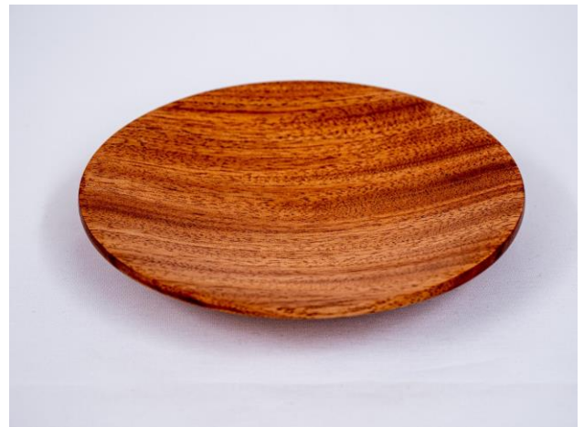
Ian Ahlen with an African Mahogany shallow bowl