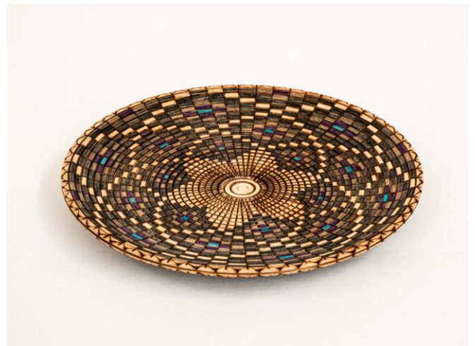
Tom Durgin with a Maple basket illusion shallow bowl