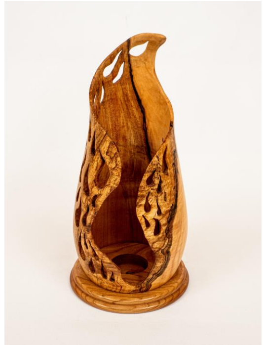
Doug Kampman with a flame vase (species not specified)