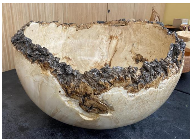
Taz Bramlette with a massive Box Elder Burl natural edge bowl