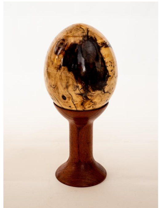
Jose Sena with a Box Elder Resin egg upon a Red Alder base