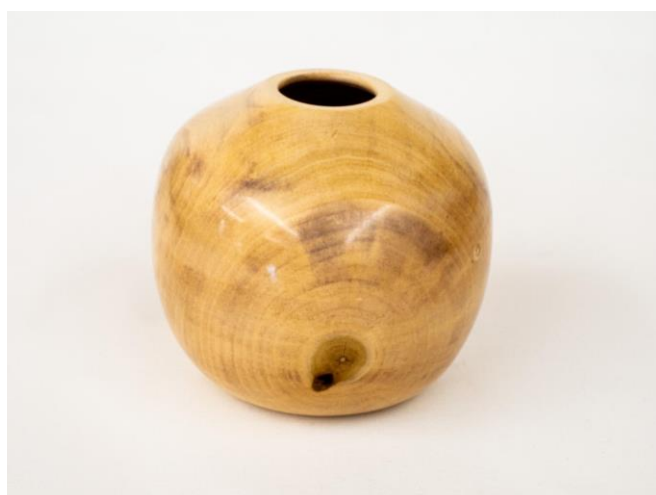
Woody Stone with a Poplar hollow form,