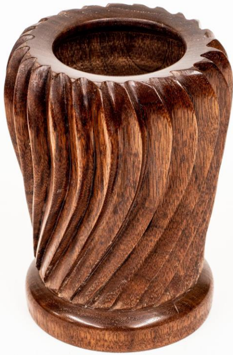
Ivan Blomgren with a Black Walnut fluted vase