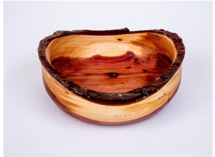
Bob Rocheleau with a Cedar live edge bowl

**The photographer will only be available until 9:25 A.M. on the day of the meeting to take photos of the instant gallery items**