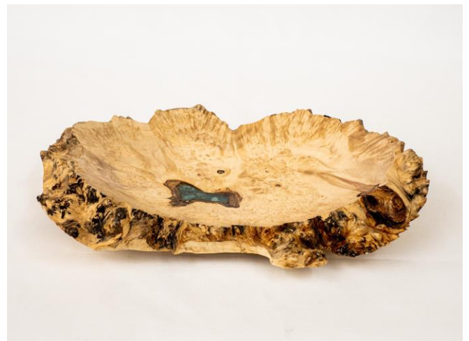
Scott Eckstein with a Box Elder Burl natural edge bowl with turquoise inlay